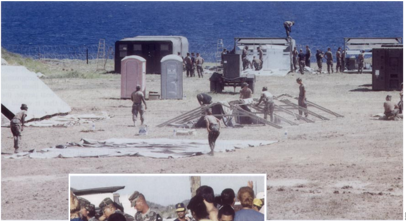
Erecting tents to house JTF-160 personnel.