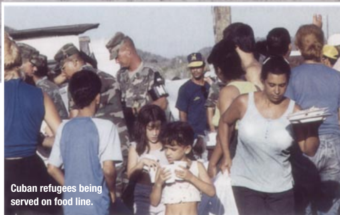
Cuban refugees being served on food line.

Shortly after the August 1994 demonstrations, the migrant camps were designated as being for single males, families, or unaccompanied minors, although single females and married couples still were housed with single men in many cases. The maximum population of each camp was set at 2,500. In October 1994, additional sub-camps were created to segregate Cubans who wanted to be repatriated or relocated to Panama. Moreover, MAG 291 and Camp X-Ray were established to administratively segregate those who endangered the safety and welfare of others. Those migrants who committed infractions were moved to MAG-291 for 7–30 days. Felons and those who posed serious and documented threats went to Camp X-Ray