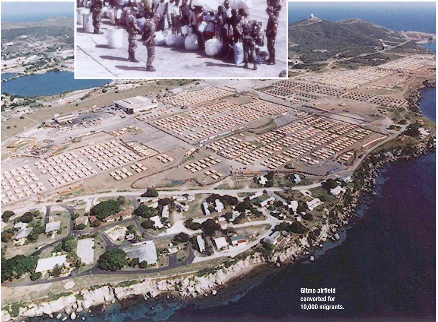
Citmo airfield converted for 10,000 migrants.

On arrival, Cuban refugees were typically put in camps to await processing at the migrant processing center. Because of a lack of vehicles, some refugees took up to two weeks to reach the center. As Coast Guard and Navy vessels continued to pick up rafters at record rates, off-loading and transporting migrants impacted on vehicular support between the camps. JTF-160 initiated a database known as the deployable mass population identification and tracking system (DMPITS), consisting of a five-station processing center. Fully staffed, it could process 1,500 migrants per day, although the average was between 800 and 1,200.