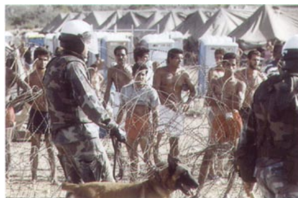
Military police patrolling refugee camp.

The camps were being constructed and filled to capacity in a matter of days, with command then turned over to incoming military police units. Was Sea Signal really a military police mission? Refugees, furious over living conditions and the abrupt change in immigration policy, complained, demonstrated, and eventually rioted.